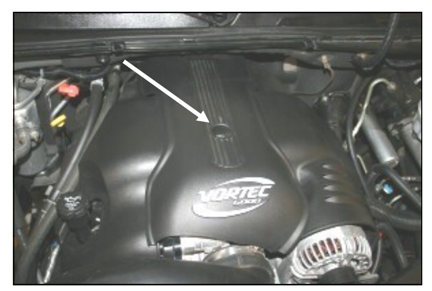
1. <u>Disconnect negative battery cable.</u>

Full color instructions can be viewed on our web site at Airaid.com. Use the Product Search function to find your part number, and click View Details.