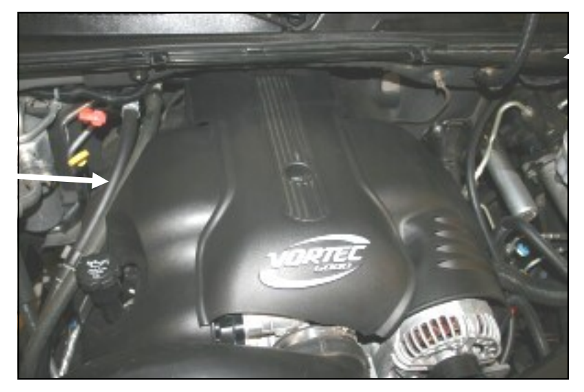
7. Re-install the beauty cover and bolt. If you purchased the 200-919 MIT Kit, skip to step #10. If you purchased the 200-719 Jr. Kit, proceed to step #8.