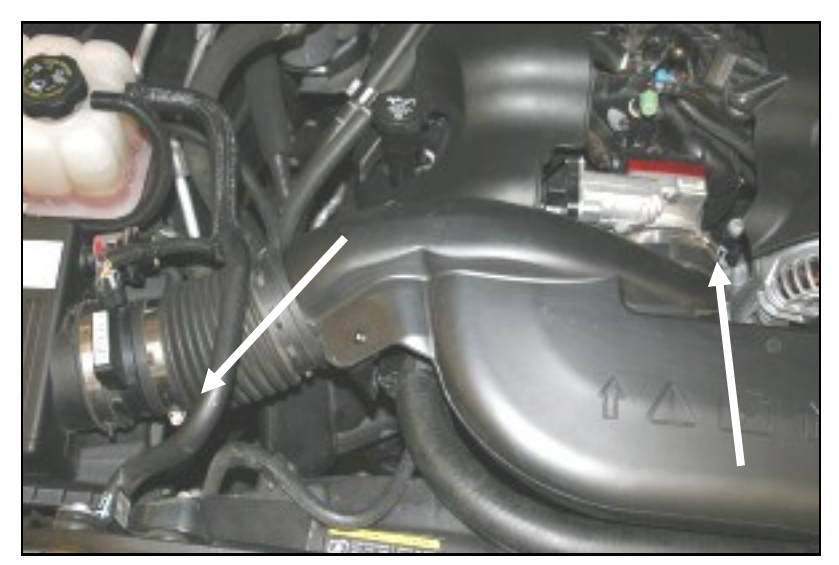
2. Loosen the hose clamps on both ends of the factory intake tube.