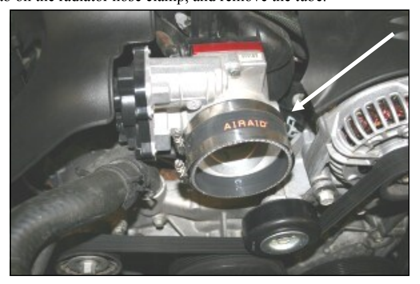
5. Install the coupler (#4) and two #64 hose clamps (#6) on the throttle body as shown. Leave the hose clamps loose for now.