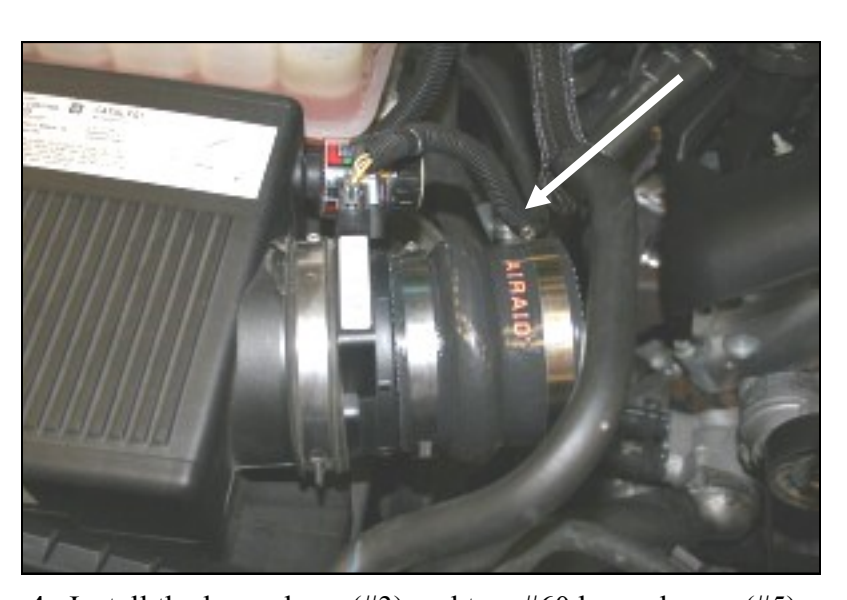
4. Install the hump hose (#3) and two #60 hose clamps (#5) on the Mass Air Flow sensor as shown. Leave the clamps loose for now.