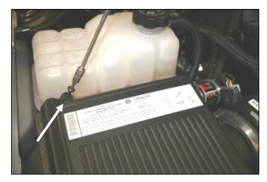
8. If you purchased the 200-719 Jr. Kit, remove 4 screws in the factory airbox with a #25 Torx bit, and remove the factory air filter.