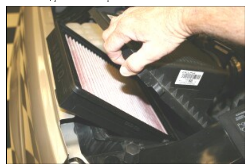
9. Install the Airaid Premium filter into the factory airbox, and re-install the 4 screws.