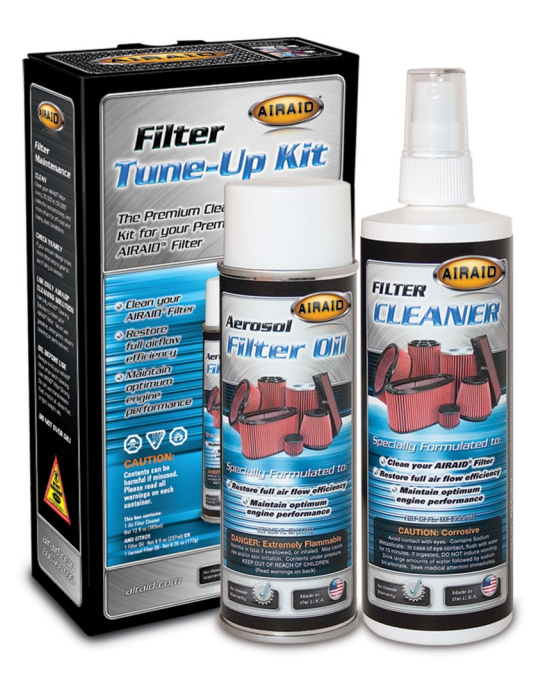
P/N 790-551 Aerosol Spray P/N 790-550 Squeeze Spray