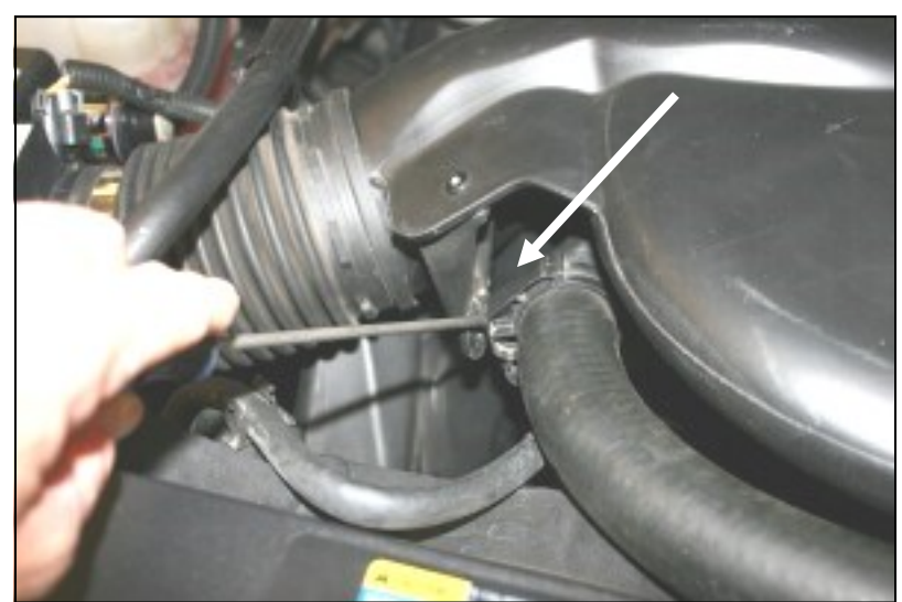
3. With a screwdriver, pry the factory tube away from the plastic tab on the radiator hose clamp, and remove the tube.

With a 5/16" socket, remove one bolt on the top of the beauty cover. Set the bolt and the cover aside for re-installation later.